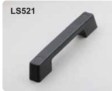
LS521 Main material and finish: Black ABS