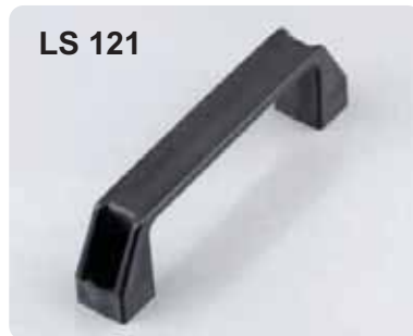
LS121 Main Material and Finish: Black PA